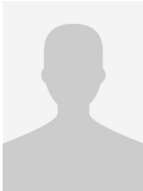
Vacant Senior Assistant